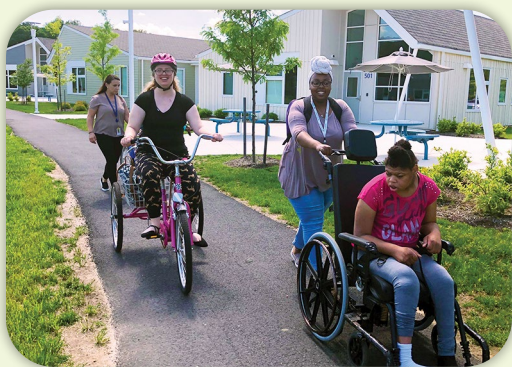
Bancroft Raymond & Joanne Welsh Campus, Mt. Laurel, NJ

Our group homes are located in neighborhoods in southern New Jersey and provide children with a supported environment in which they work on daily living skills, receive allied therapies and engage in community activities. Children enjoy abundant opportunities for socialization through many community-based activities.