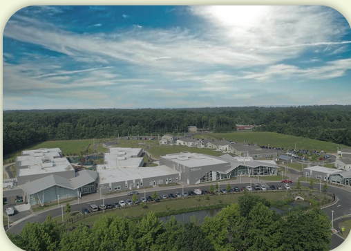
Bancroft Raymond & Joanne Welsh Campus, Mt. Laurel, NJ

Our group homes are located in neighborhoods in southern New Jersey and provide children with a supported environment in which they work on daily living skills, receive allied therapies and engage in community activities. Children enjoy abundant opportunities for socialization through many community-based activities.