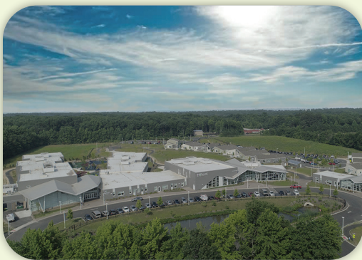
Bancroft Raymond & Joanne Welsh Campus, Mt. Laurel, NJ

Our group homes are located in neighborhoods in southern New Jersey and provide children with a supported environment in which they work on daily living skills, receive allied therapies and engage in community activities. Children enjoy abundant opportunities for socialization through many community-based activities.